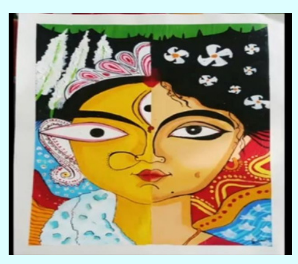
Shrestha Saha, Grade-VII