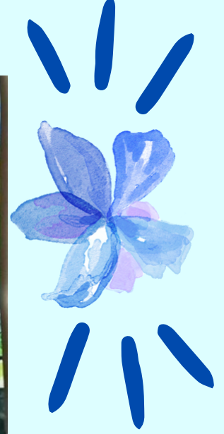
Arushi Kundu, Grade-VIII