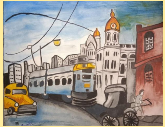
Pronita Saha, Class VII